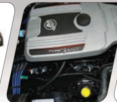
Model 315 Multi Point Injection TowSports Displacement 5.7 Litres Rated Power 315hp