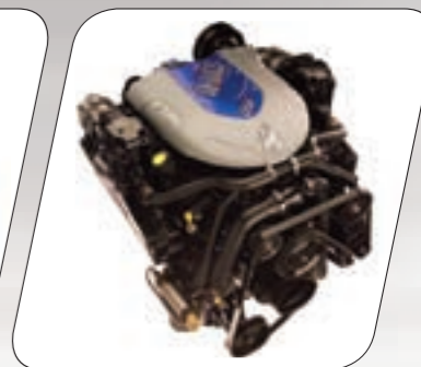
Model Scorpion 377 MPI TowSports Displacement 6.2 Litres Rated Power 340hp