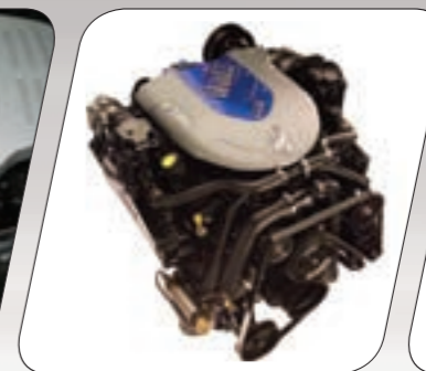
Model Scorpion 350 MPI TowSports Displacement 5.7 Litres Rated Power 330hp