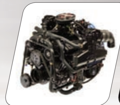
Model 315 Carb TowSports Displacement 5.7 Litres Rated Power 315hp